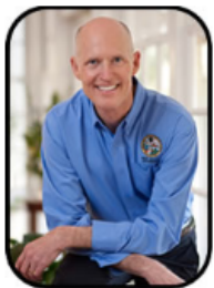
Rick Scott Governor of Florida http://www.flgov.com/