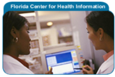
Florida Center for Health Information

Welcome to the Agency for Health Care Administration's Web site. Our mission is Better Health Care for All Floridians, and together we are responsible for the administration of the Medicaid program, for the licensure and regulation of health facilities and for providing information to Floridians about the quality of the health care they receive in Florida... more information