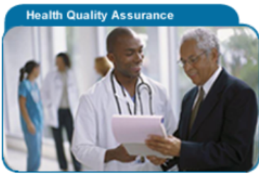
Health Quality Assurance